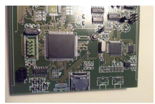
The ARM processor and the microSD card