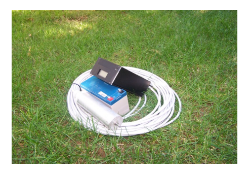
The SRi32L recorder with the C100 passive sensor